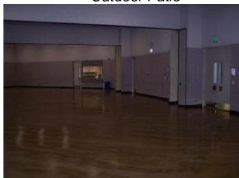
Large Main Hall